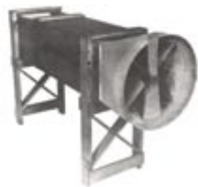
Wenham (UK) 1 st Wind Tunnel built