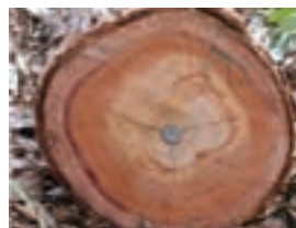
SGR1266: bottom of lowest merchantable log