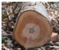
SGR1353: bottom of lowest merchantable log