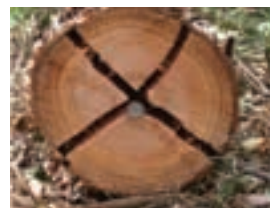
High volume clone rejected as a low split selection in the same trial