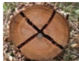
High volume clone rejected as a low split selection in the same trial