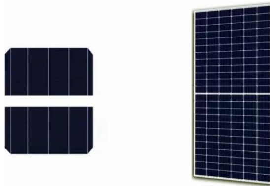
Figure 1. Typical passivated emitter and rear contact and half-cut solar modules

In addition, smaller cells experience reduced mechanical stresses, which limits chances for cracking. Also with shading, the advantage is that if one half of a module is shaded, the other half will still perform.