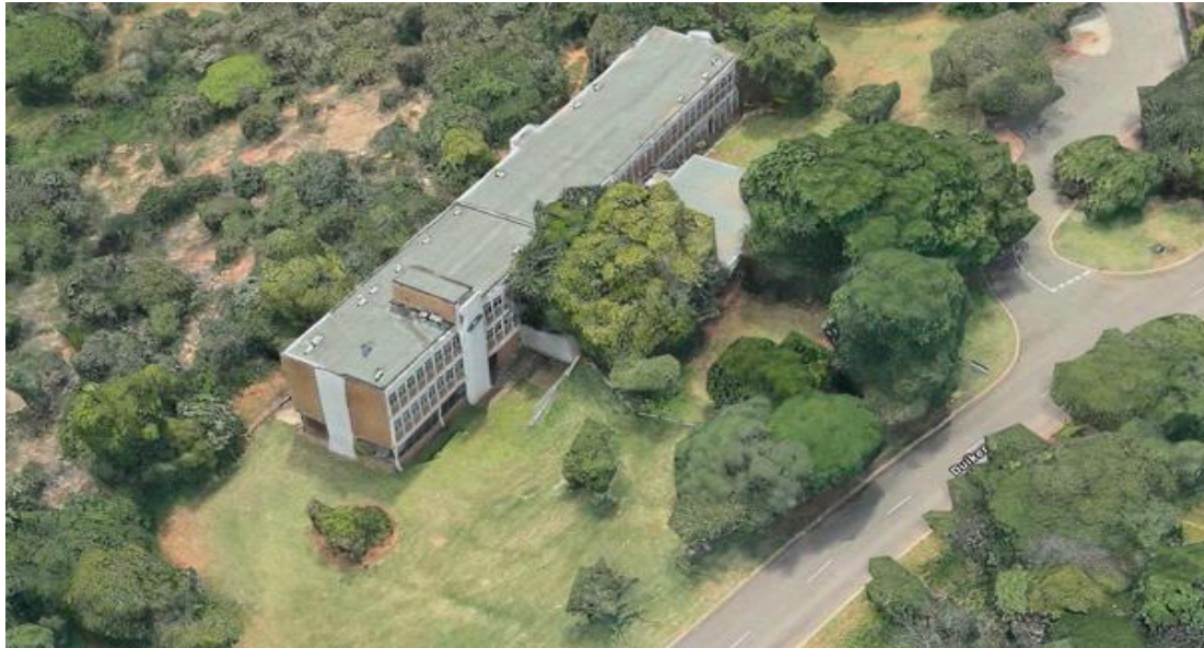
Building 34- Overall view and Storm water Catchment area