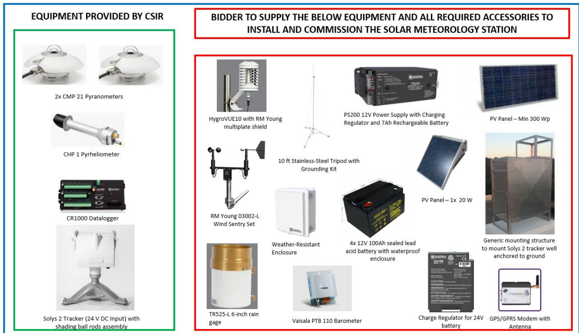
Figure 2 : Meteorology station to be installed with the shown components at Upington site